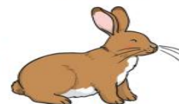
rabbit un lapin