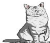
cat un chat