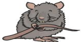
rat un rat