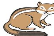
chipmunk un tamia