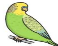
budgie une perruche