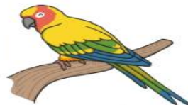
parrot un perroquet