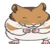
hamster un hamster