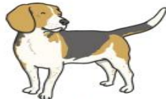
dog un chien