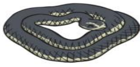
snake un serpent